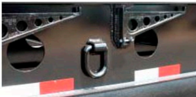
Flat style lash rings and outriggers

Shown with optional bolt on aluminum gooseneck cover and center deck.