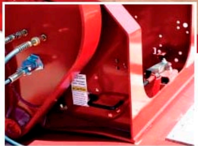
Gooseneck lock pin