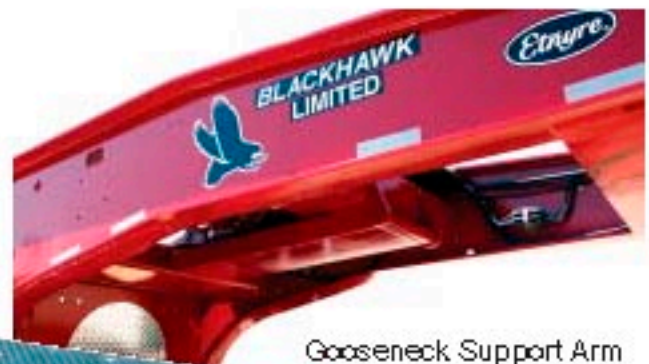
Gooseneck Support Arm