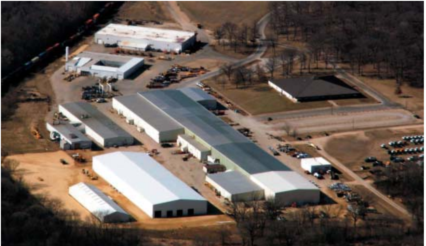
325,00 square foot facility located on 73 acres in rural Ogle County, Illinois