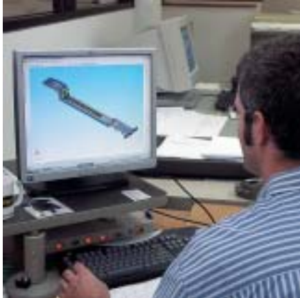
Designed and engineered using 3D modeling and comprehensive stress analysis software.