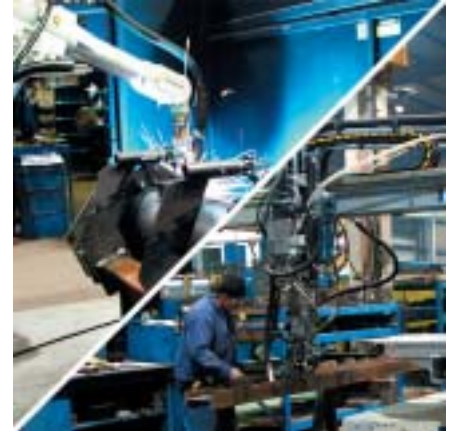
Programmable robotic welding ensures quality fabrication.