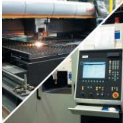
Precision laser cutting technology.