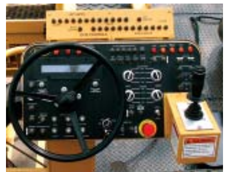
Control Panel provides clear view and easy control. Change from forward to reverse with one hand without clutching.