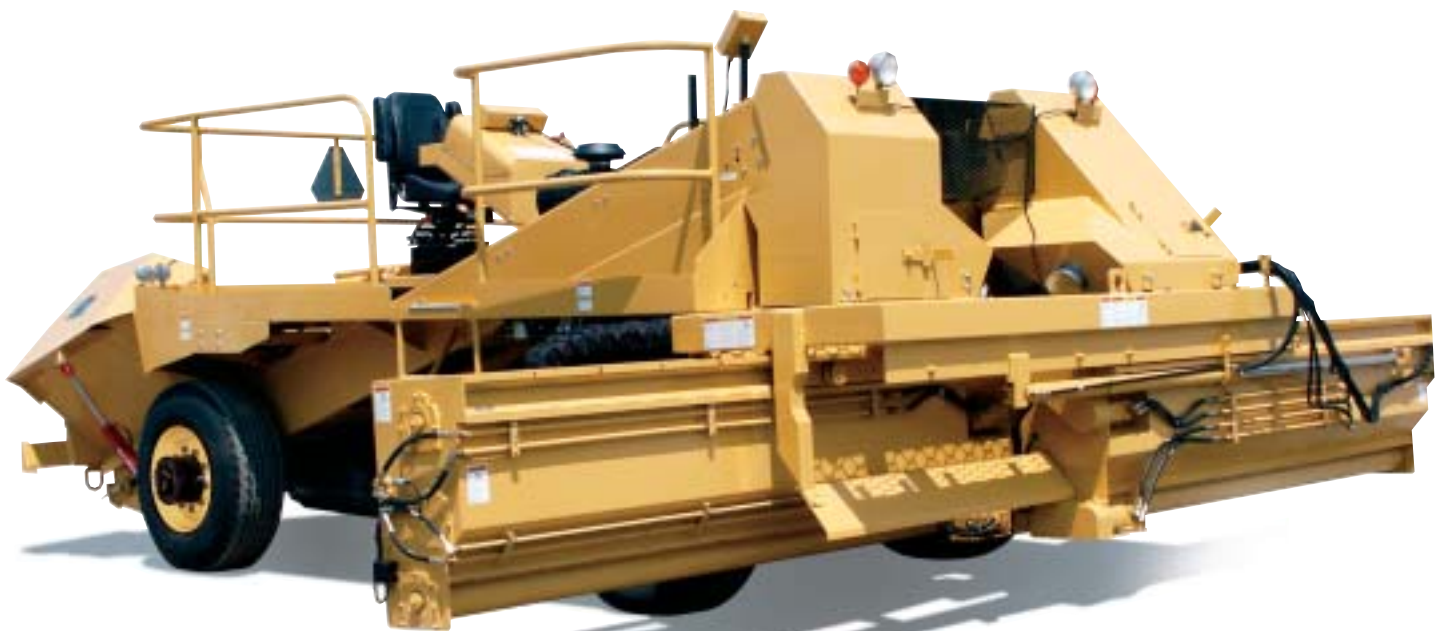
ChipSpreader with four wheel drive and variable width spread hopper