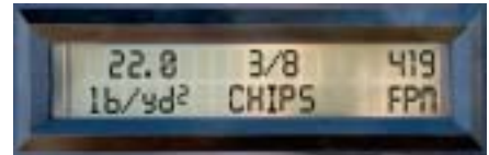
Computer maintains a uniform aggregate application even during changes in road speed. Stores five different application rates.