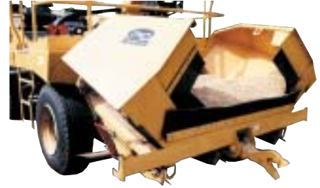
Folding Bat Wing Rear Receiving Hopper provides increased aggregate capacity and easy clean out of hopper. Facilitates easy change of aggregate types.