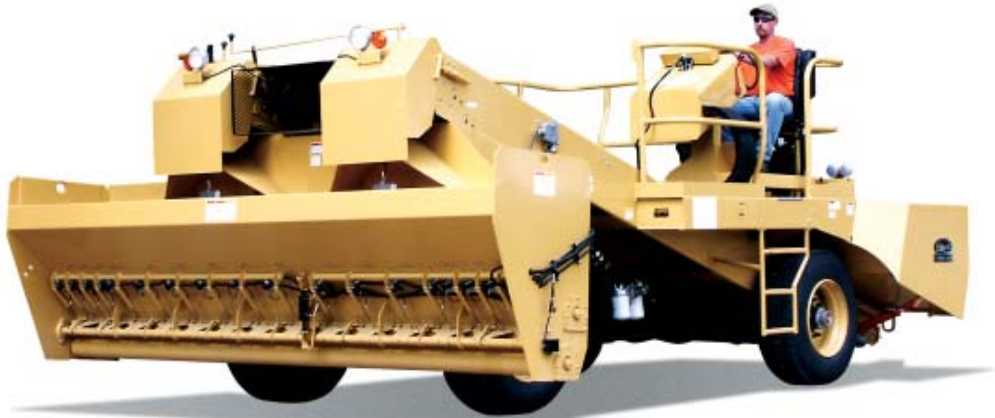
Front wheel drive ChipSpreader with standard spread hopper