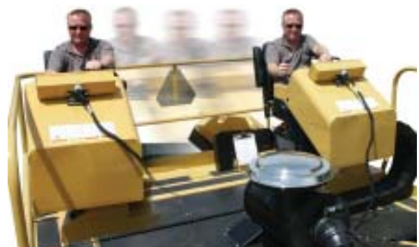
Sliding operator station provides the visibility and control to increase operating efficiency and reduce fatigue. Available with manual or powered control.