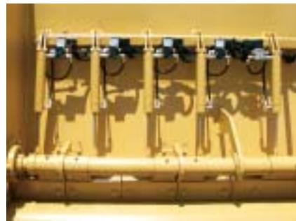
Individual gate controls on standard and variable width hoppers offer variable spread width operated from a remote operators panel.